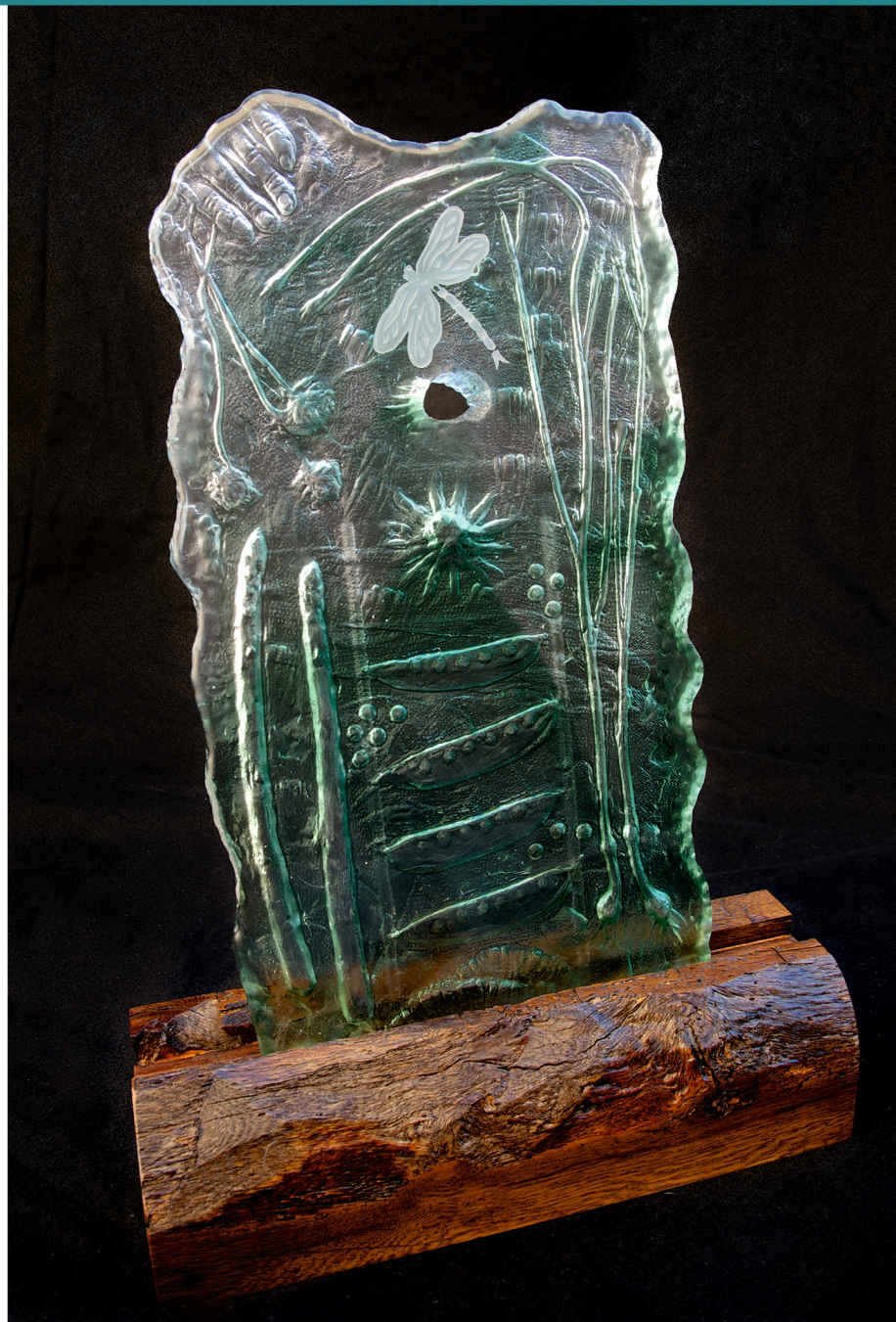
My Garden Helper Cast Glass Example Portfolio Piece