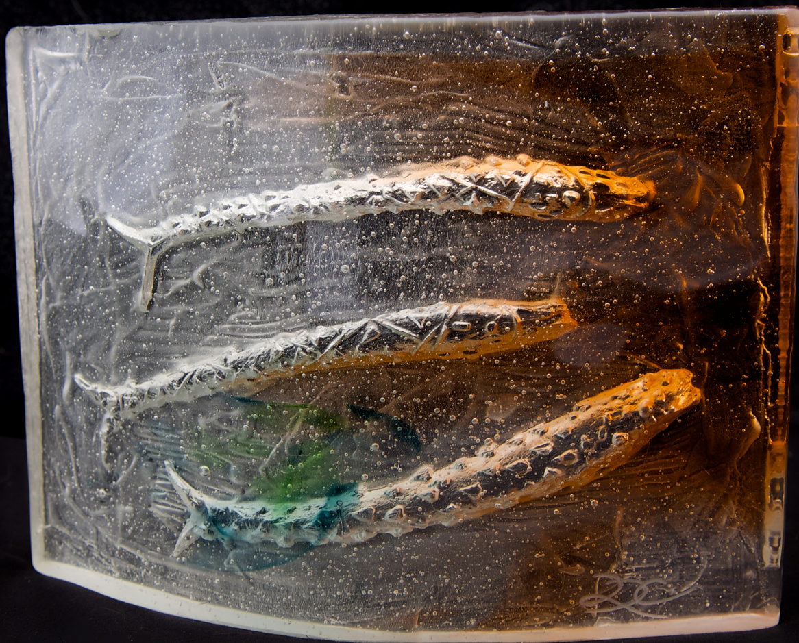
Swimming Towards the Light Cast Glass Example Portfolio Piece