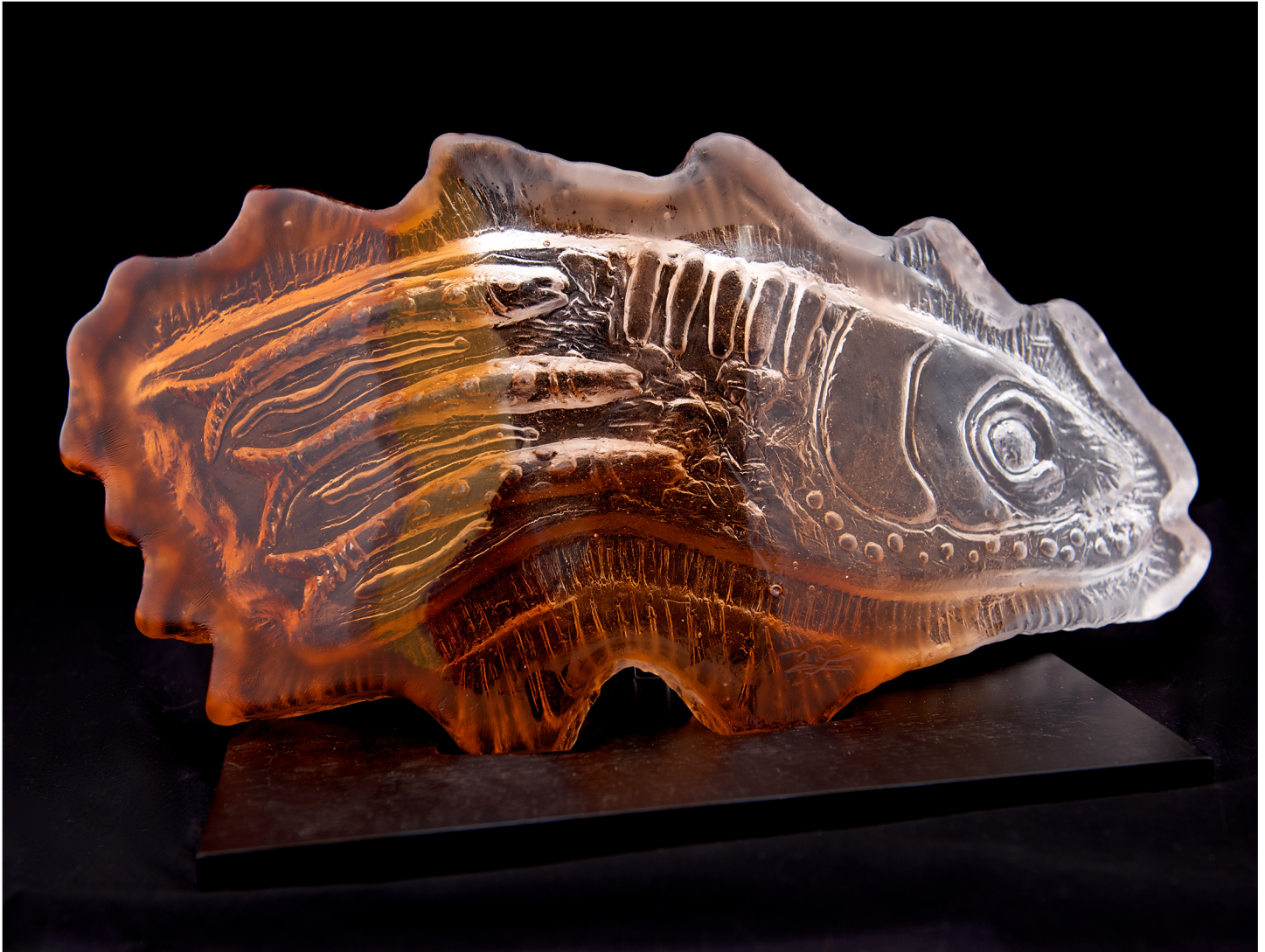
Let the Hunt Begin Cast Glass Example Portfolio Piece