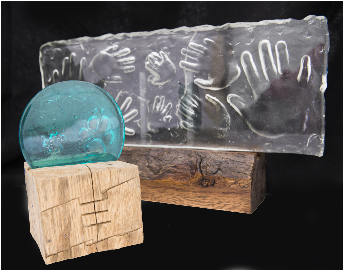
Family Hands (clear) & Pet Prints (teal; dog, cat, bird)